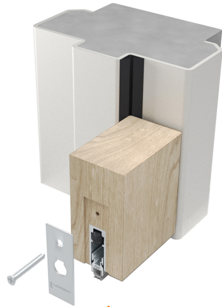
▲ LAS1212 Batwing® shown with LAS8001 si drop seal