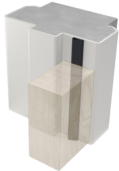
▲ LAS1602BB Shown with LAS8001 si