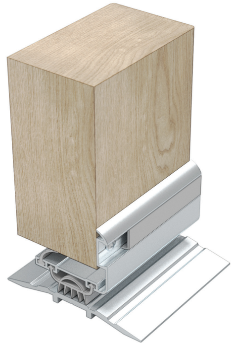
▲ LAS3007 si shown with LAS4010