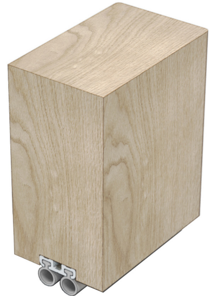
DOOR BOTTOM SEALS